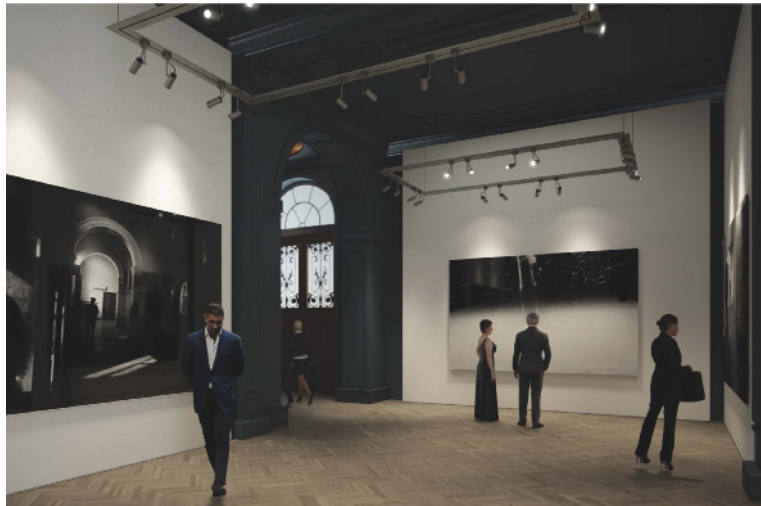
Vue du projet de rénovation, agence Wilmotte et associés