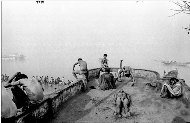
3. Morning Activity, Mullick Ghat, Kolkata, 1990