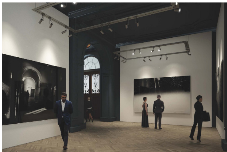
Vue du projet de rénovation, agence Wilmotte et associés