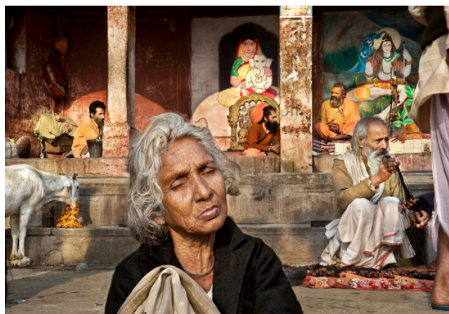
5. A pilgrim, Varanasi, 2008