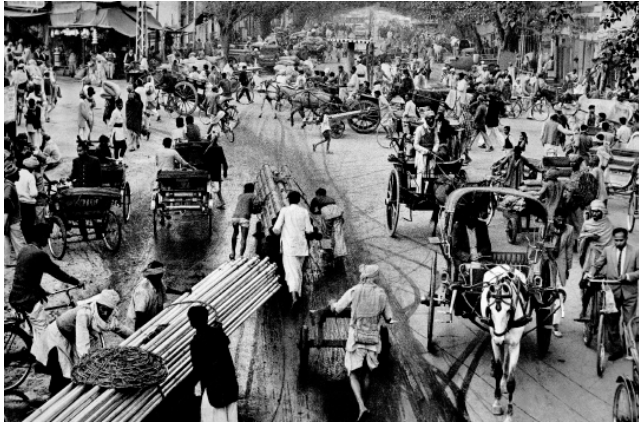
1. Traffic at Chanri Bazar, Delhi, 1965