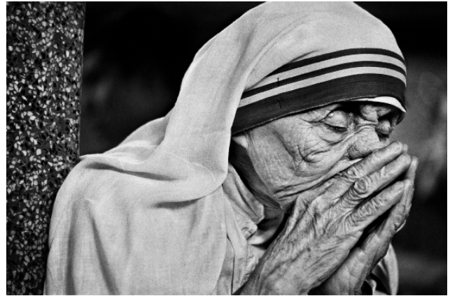
4. Mother Teresa in prayer, Kolkata, 1995