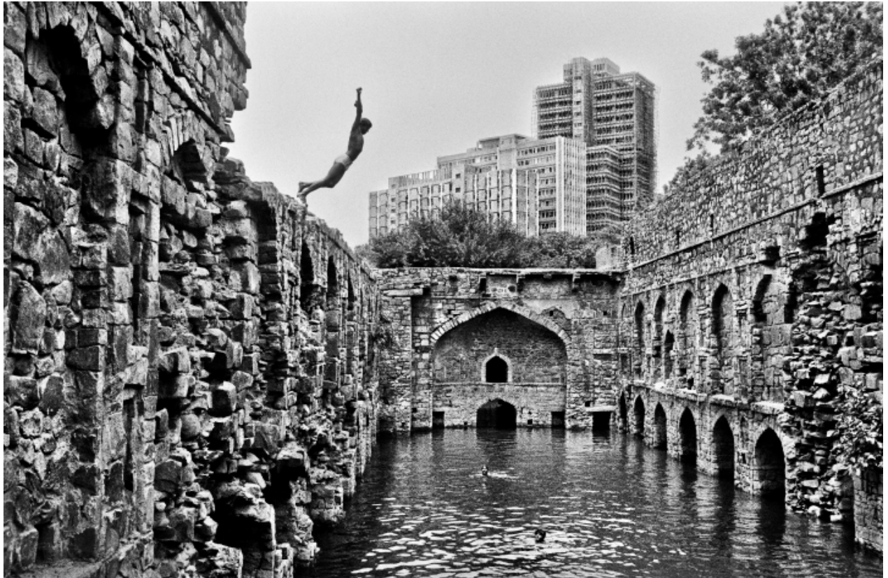
Diving into Ugrasen Baoli, Delhi, 1971