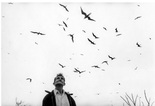
El señor de los pájaros, Nayarit, México, 1984