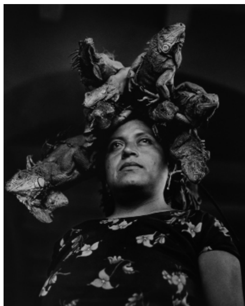
Nuestra Señora de las Iguanas, Juchitán, México, 1979