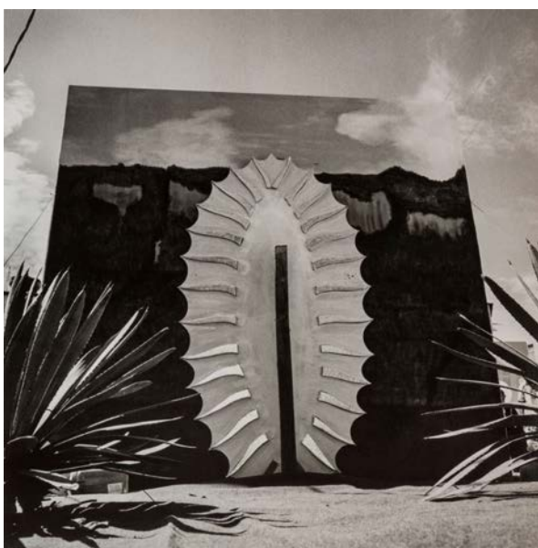
Virgen de Guadalupe, Chalma, 2007