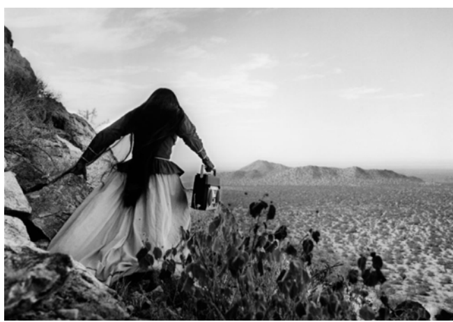
Mujer Ángel, Desierto de Sonora, 1979