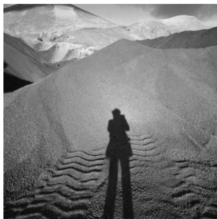
Los ojos de la tierra, 2023