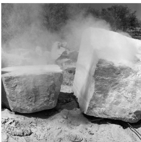
Tecali. Puebla, 2011