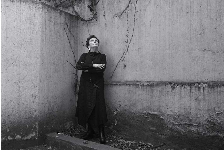
Graciela Iturbide.

The Académie des beaux-arts Photography Award – William Klein was created in 2019 by the Académie des beaux-arts with the support of the Chengdu Contemporary Image Museum and pays tribute to the work of William Klein.